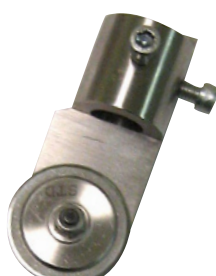
1" Round Knife