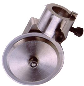
2" Round Knife